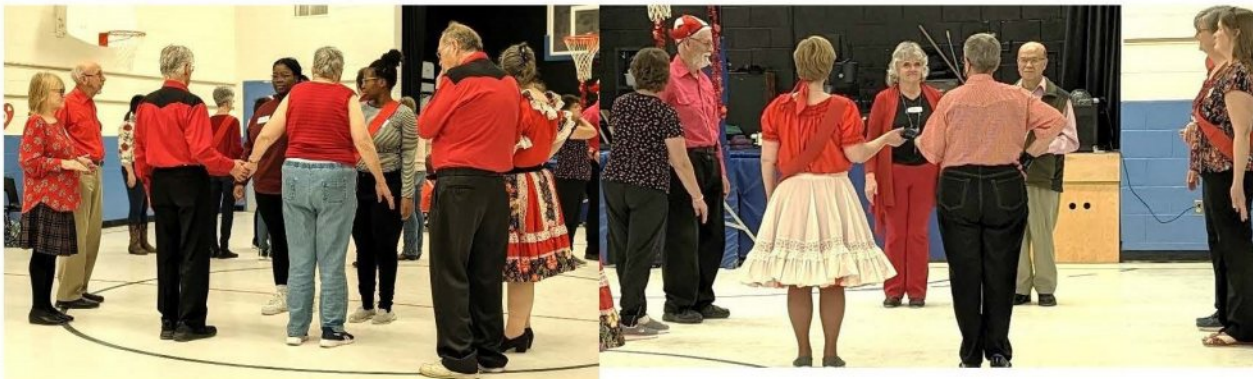
Limestone Square & Round Dance Club Valentine's Dance - 3+ Squares - lots of goodies!