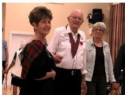
Some of our Glengarry Tartans attending Tartans & Kilts 2022 hosted by the Swinging Bs Cornwall