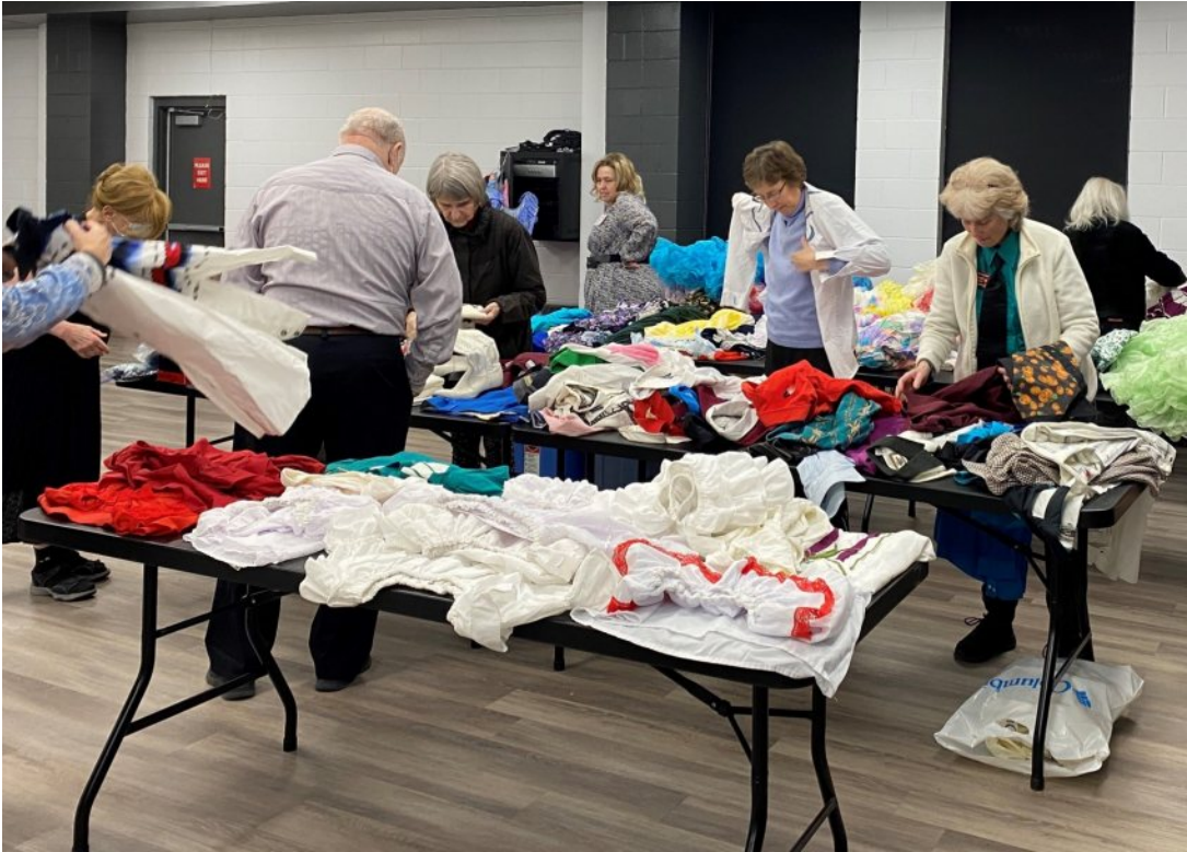
Our Big & Beautiful Square Dance Clothing Sale - bargain hunters galore (Submitted by Pat McLachlan & Michelle Gravelle)