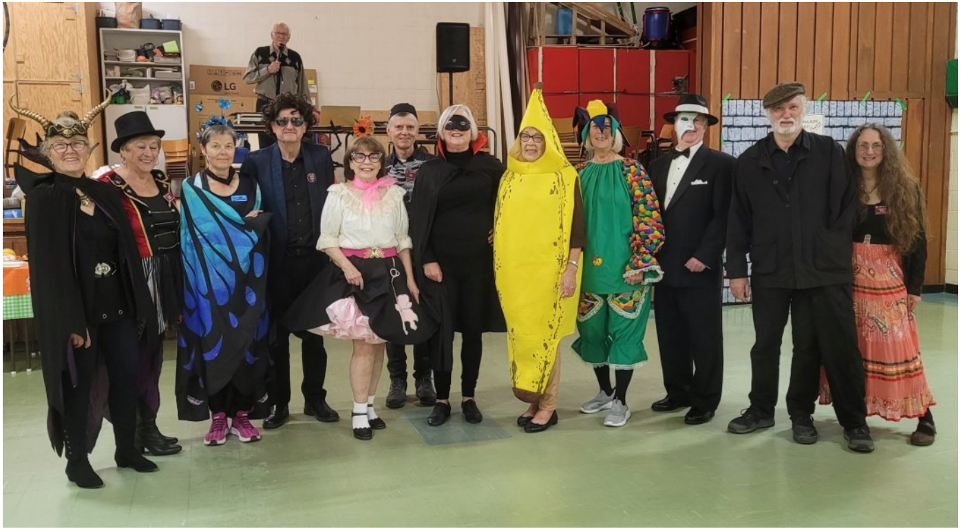
Our Plus dancers at the Meri Squares Halloween Party