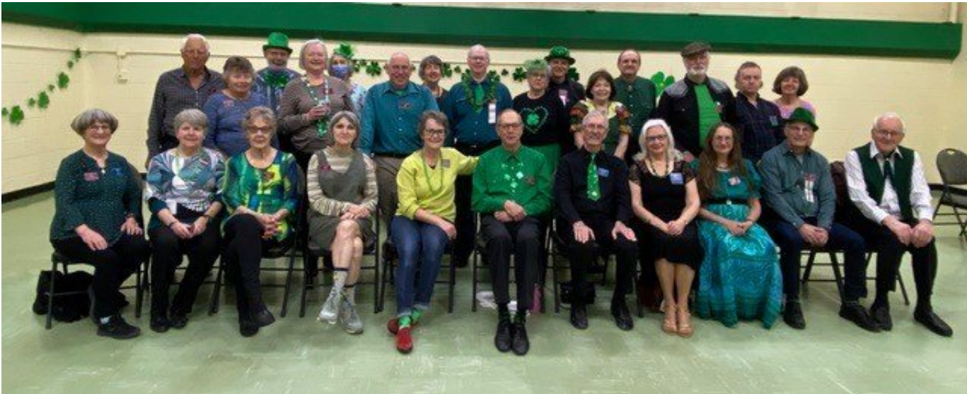
St. Patrick's Plus Dance