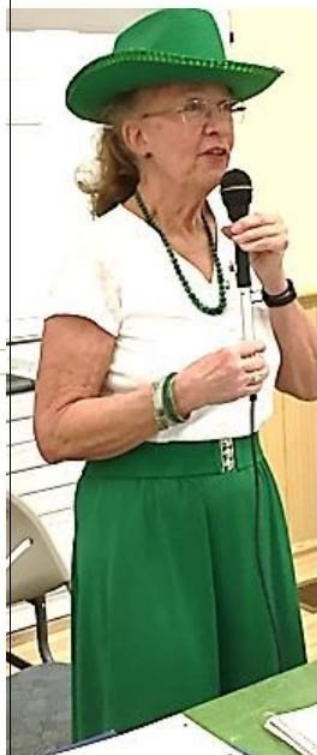
Just some good old Irish FUN!

but it is with your heart that you dance