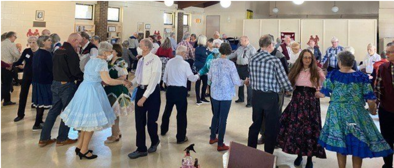
Meri Mingle Plus Dance