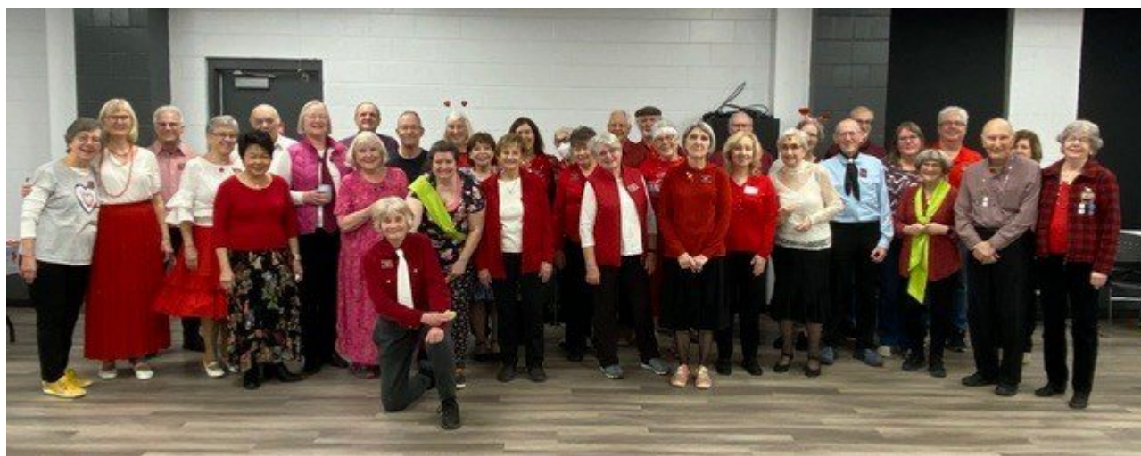
Our SSD Valentine Dance